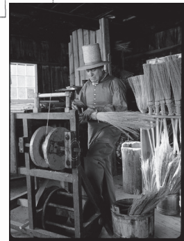
OSV Broom Maker

Northeast Regional Conference on the Social Studies Tuesday, April 12 - 7:30 A.M. to 5:00 P.M. Wednesday, April 13 - 7:30 A.M. to 3:30 P.M.