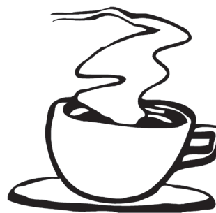
Exhibit hours are:

Please join us for complimentary coffee from 7:30 to 8:30 a.m. in the exhibit area.